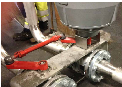
Each of the two AUMA fail safe actuators drives a pair of cooling water valves in tandem.